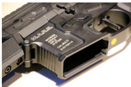
There's anti-slip in front of magwell which facilitates holding.