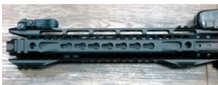
The middle part of handguard is made thinner, makes users comfortable even without a handstop.