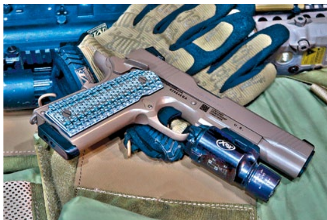
Mainland China Double Bell's M45A1 is a world premier release. Even Tokyo Marui has yet to develop a replica.