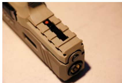
Second safety located in the middle of the tactical rail.