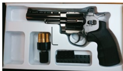
Far San CS-04 revolver and accessories.

pull the trigger, which would actuate the hammer. However, this process generates heavy pressure to trigger. To solve such a problem, CS-04 is designed to have shorter hammer travel (about 11mm). Shooters would feel a tipping point which indicates the hammer's incoming strike. This is done by manipulating leverage. The power source is 12g CO2 bottle. The CO2 cartridge compartment is located inside the grip. Users may pull the back of the grip to reveal the compartment. The CO2 cartridge can provide enough air pressure for firing 40 rounds. The muzzle velocity is around 140 m/s (459