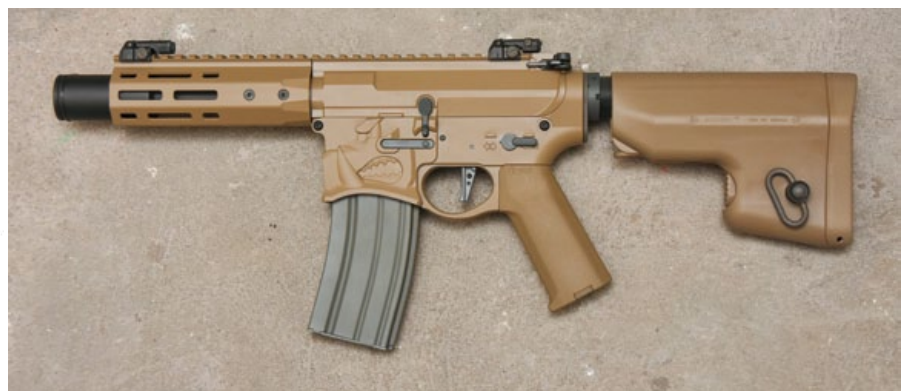
Warthog VSBR that is only 570mm in length.

All these characteristics, however, make users wonder, given that the Warthog and The Jack are both based on Amoeba AR15, Are these two SB rifles the same as Amoeba AR15 except in the lower receiver? We can