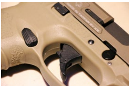
XFG's two stage trigger is the first line safety.

more improved over the grip found on the previous Alpha pistol. The backs trap on the back of the grip is interchangeable for those who need a bigger fuller grip, and comes with a spare piece featuring more of a bulge design over the flat standard back strap. The XFG follows the mainstream modern design, but also allows room for modification for those components that are prone to wear and tear, making the new pistol feel like an improved model over the previous Alpha. But upon closer inspection, the new XFG is a completely different design and is made from entirely new machine