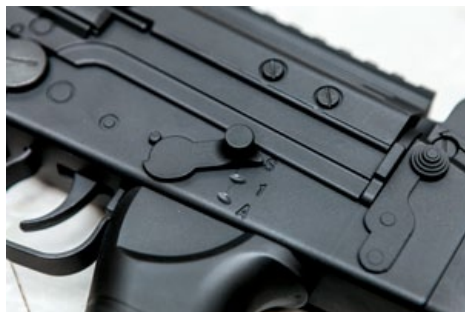
ASP SA58 Keymod has three fire mode including safety, semi and full auto.