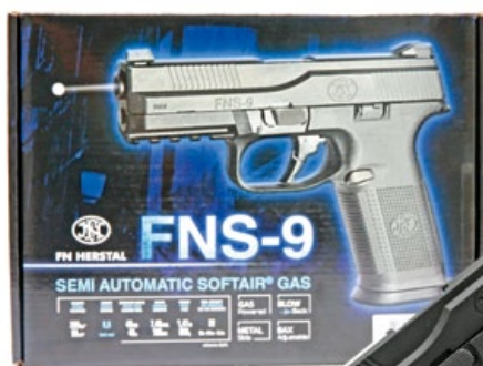
Cybergun's FNS-9 packaging, simple and elegant.