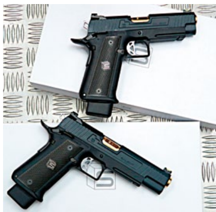
There are 4.3 inch (upper) and 5.1 inch (lower) DS 2011 models to choose from.