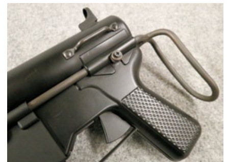
Grip design is original, which is very similar to real steel.