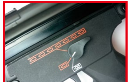
Semi Auto and Safe on the fire control selector.