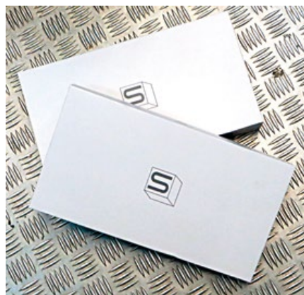
EMG SAI DS 2011 packaging looks like it was made for Gucci handbag.