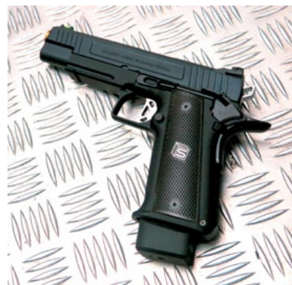
5.1 inch model feels very thick at the grip, due to the double stack design.