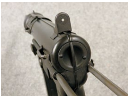
Non-adjustable iron sight of the ICS M3A1.

The upper receiver of the ICS M3A1 EBB SMG is made of aluminum, while the lower receiver is plastic, resulting in a light weight airsoft game gun. ICS designed a straight gear box, placing the battery behind. Open the cover