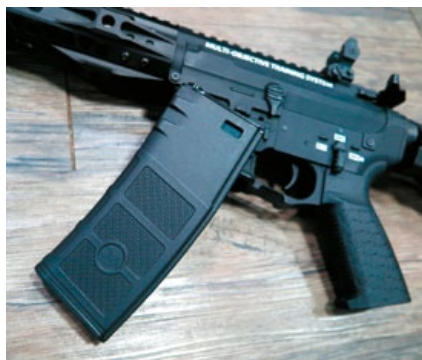
Mid-cap 130 rounds magazine designed by G&P.