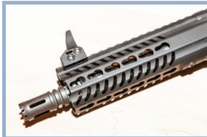
Aluminum Keymod handguard looks trendy and comfortable to hold.