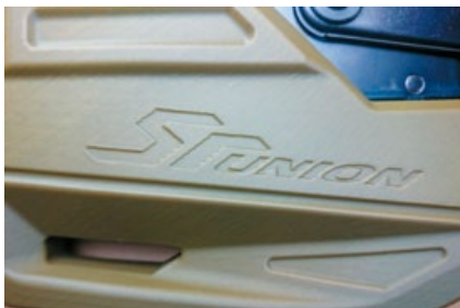
The SRU engraving on the stock.