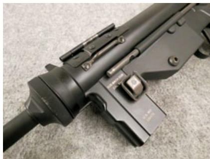
Upper receiver is made of aluminum, making it sturdy and reliable.