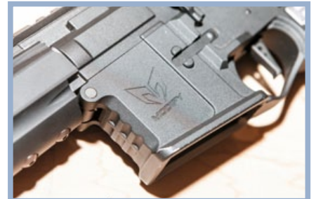
There's ragged surface in front of magwell, which helps players to hold.