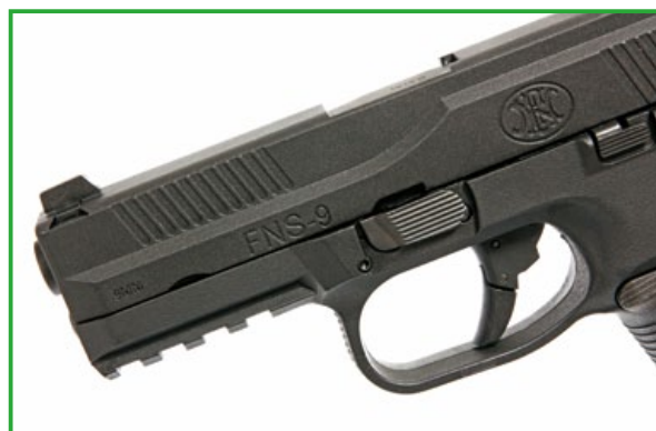
The slide's left side has all FN factory markings.