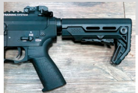
Thor is equipped with a Viper CQB stock which is for real assault rifle.