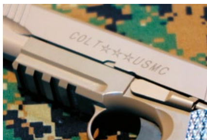
DB M45A slide has detail engravings.