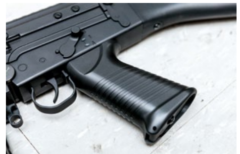
Equipped with a SAW pistol grip, this carbine can be held firmly.