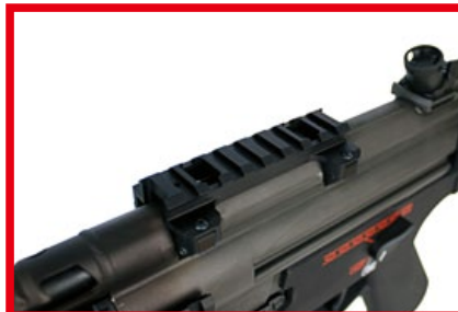
Low-profile scope mount, compatible with various kinds of scopes.