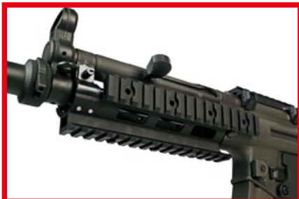
SWAT A4 Tactical with newly developed RAS rail.

the 4th generation ERB into the gun, furthermore, the compact size and the stock of the SWAT A4 Tactical enhanced the feeling of the recoil on your shoulder. That is an experience you must try on! Bolt SWAT has a unique design using the charging handle as a selector for the recoil. The ERB system would be turned off when the charging handle is locked back. But