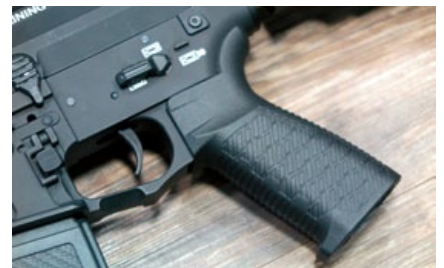
Pistol style grip is made of enhanced engineering polymer.