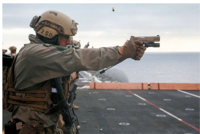
M45A1 CQBP was developed for USMCMEU's tactical pistol requirements.

With regards to appearance, the DB M45A1 GBB pistol is quite satisfying to look at. From the slide, to the frame, to the outer barrel, and iron sights-one can observe these components are all made by intricate and well-