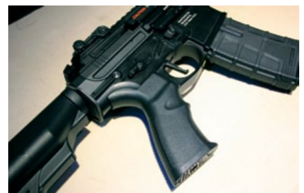
Reinforced ergonomic pistol grip makes players feel comfortable even after holding it for a period of time.