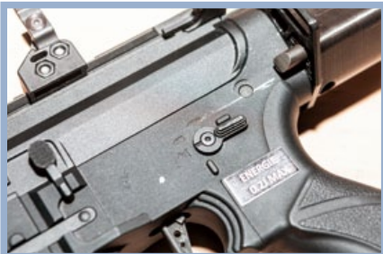
45 degree fire selector which may change fire modes swiftly.

M odify, after years of continuing research, finally created the PDW with its experiences in developing Extreme Tactical Carbine CQB, or XTC-CQB. Modify PDW is equipped with 7 inch outer barrel (inner barrel is 185 mm), together with aluminum made Keymod handguard that never wobbles. The barrel is so compact that it allows users to move fast in a competition. There is a Picatinny rail that extends to the front on top of this PDW, to which users can attach accessories. There are a few openings on the left and the right sides of the handguard, which reduce overall weight and add a masculine temperament to this gun. The upper and lower receivers are built with light weight, robust aluminum alloy. The front side of the magazine well is made ragged to increase friction so that users can hold it with comfort. The opening of the magazine well is made larger like a funnel to help users reload magazines quickly. To make sure this gun never wobbles, the barrel is locked in place in three positions. Also, the Hop Up chamber is locked into place with four sides screwed tight to make sure the barrel is totally fixed so that shooting accuracy is improved. This PDW also comes with 14mm counter-clockwise steel flash hider, flip-up front sight / rear