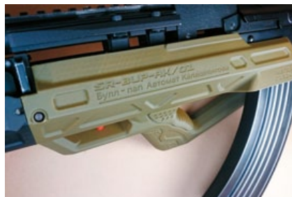
The Russian words on the pistol grip reads "stockless AK rifle".