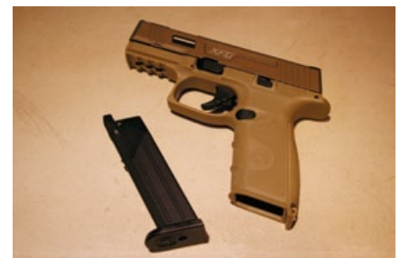
Oversized magazine works flawlessly.