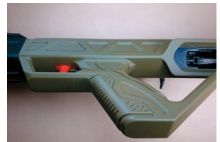
The tilted pistol grip is the most prominent feature on the SRU AK.