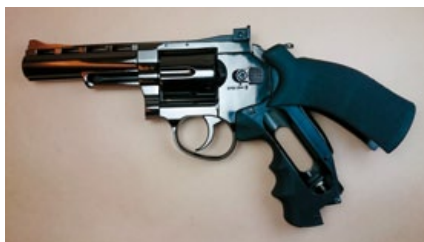
Pull the back of the grip to reveal the CO2 cartridge compartment.