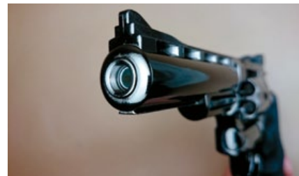
There're threads in the barrel, which allows users to add silencer.