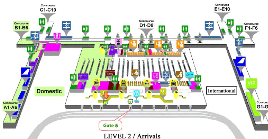
Meeting Point at Suvarnabhumi International Airport, GATE 5

All passengers entering Thailand must possess valid passports. Participants are recommended to check with local Thailand Embassies for visa applications before traveling. In order to obtain a visa, participants are requested to send by E-Mail: fencing.tha@gmail.com copy of their passports. The organizing committee will take care of the necessary formalities has to be received by the Organizing committee not later than Monday, 9 August 2017 .