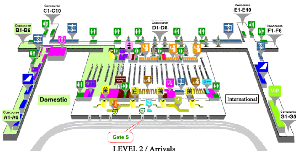
Meeting Point GATE 5 at Suvarnabhumi International Airport