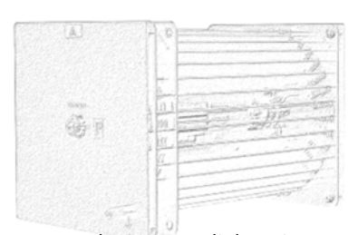
Example Open Radial Design

The open design provides good measurements but does present challenges for commercial laboratory applications. It uses an open structure to counter heat buildup which exposes the precision resistance elements, uses long electrical paths resulting in larger time constants and greater phase angle shifts (i.e. 13 inches or more for high current models), provides no protection against EMI, is susceptible to environmental effects including humidity or pressure, and is easily damaged. As an example, most competitive AC shunts, if used outside of 50% humidity, must have 20 ppm or more added to specifications