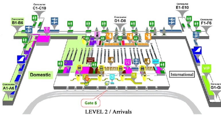
Meeting Point GATE 5 at Suvarnabhumi International Airport