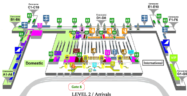
Meeting Point GATE 5 at Suvarnabhumi International Airport

(f) Smoking: Smoking in all air-conditioned public places (including education institutions) is against the law and subject to a 2,000 baht fine. Smoking is also prohibited in all covered areas, including shopping centers, restaurants, cafes and bars (some are allowed to set up special smoking rooms). Smoking is also banned in outdoor eateries, coffee shops, canteens and cafes (some areas are set aside for smoking).