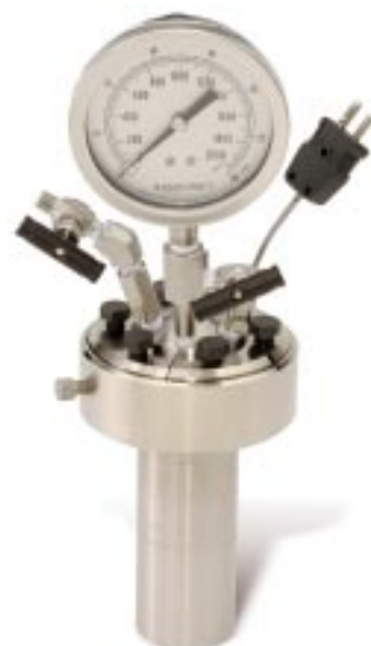
Model 4793, 100 mL Vessel