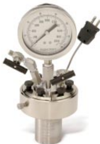
Model 4791, 25 mL Vessel

A ll 4790 Vessels come with dip tube, three valves, gage, rupture disc, and thermocouple.