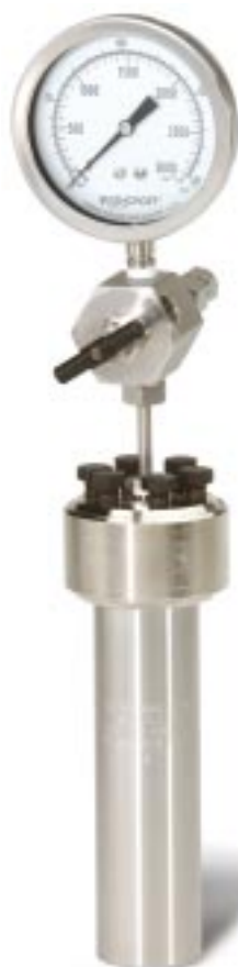
Model 4753, 200 mL Vessel, with 4316 Gage Block Assembly