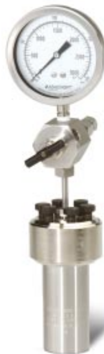
Model 4751, 125 mL Vessel, with 4316 Gage Block Assembly