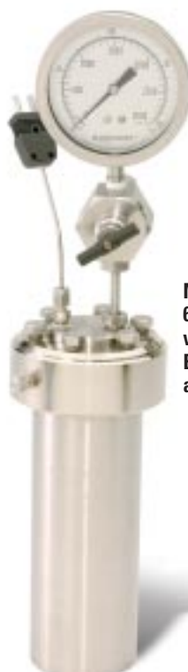
Model 4768Q, 600 mL Vessel, with 4316 Gage Block Assembly, and Thermocouple