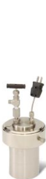
Model 4766Q, 300 mL Vessel, with A281HC Adapter, A146VB Needle Valve, and Thermocouple