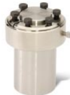
Model 4760, 300 mL Vessel with Blank Head