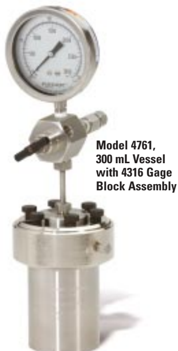
Model 4761, 300 mL Vessel with 4316 Gage Block Assembly