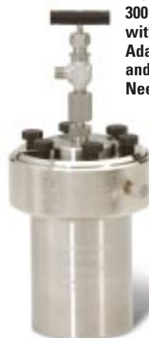
Model 4761, 300 mL Vessel with A281HC Adapter and A146VB Needle Valve