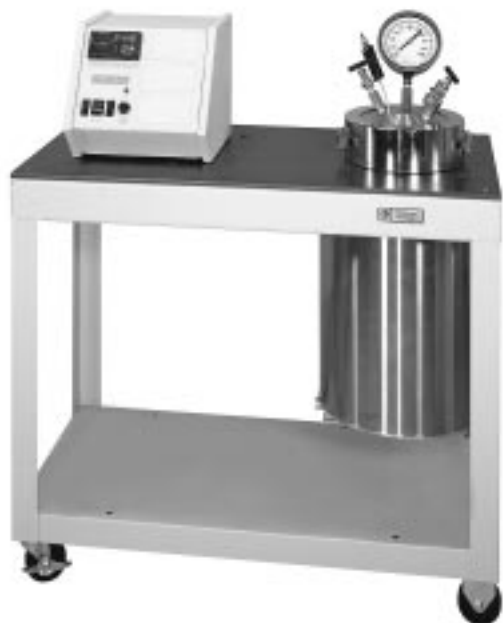
Model 4666Q, 2 Gallon Vessel, in 4929 Heater with 4842 Temperature Controller