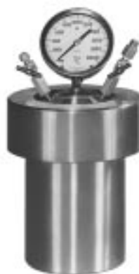
Model 4662Q, 1 Gallon Vessel, with Two Valves, Gage, Thermowell and O-Ring