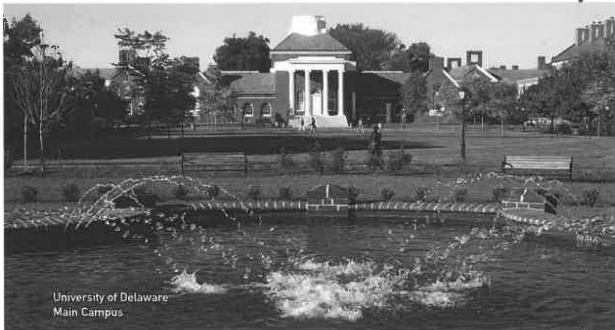
University of Delaware Main Campus

THE UNIVERSITY OF DELAWARE has grown from its founding as a small private academy in 1743 to a major university. The University offers an impressive collection of educational resources. The 16,000 undergraduate students may choose to major in any one or more of over 100 academic majors. The University's distinguished faculty includes internationally known scientists, authors and teachers, who are committed to continuing the University of Delaware's tradition in providing one of the highest quality undergraduate educations available in the United States.