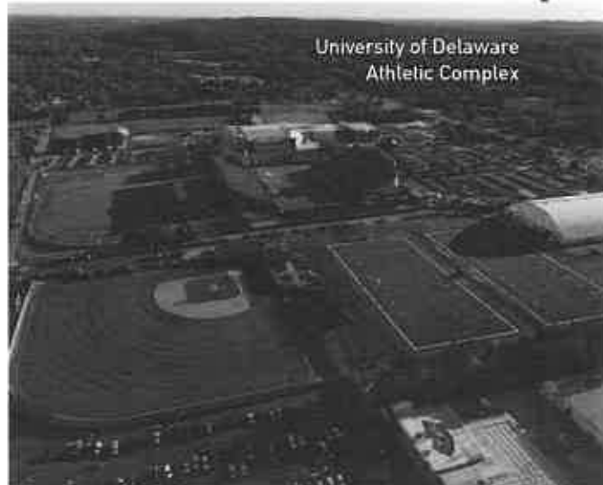
University of Delaware Athletic Complex

Visit www.udel.edu to learn more about the University.