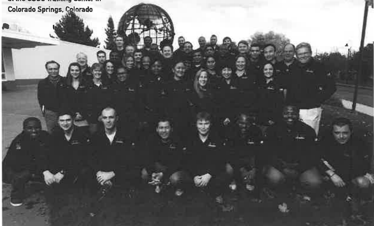
Eighth-year ICECP participants at the USOC Training Center in Colorado Springs, Colorado

"This is a very high classed coaching course taking into consideration its content and intensity, great idea to keep, there should be a follow up of past participants after they pass through this program for an international network. There should be a physical exercise by all coaches as a group twice a week, a proper tour of the gym because some of us saw certain machines for the first time. Thanks for all the great work!"